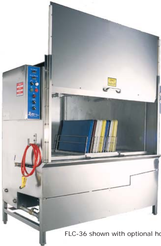
FLC-36 shown with optional hose