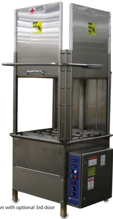
SL-2S - Shown with optional 3rd door